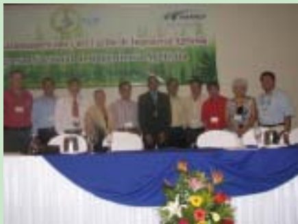
Board of Director 2008-2010